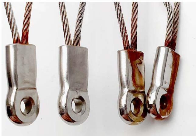
Figure 1: Example image of surface corrosion at the lower edge of the mesh in laboratory tests

In addition, dust deposits can build up on the nets when installed outdoors. Depending on the location and weathering, the dust can